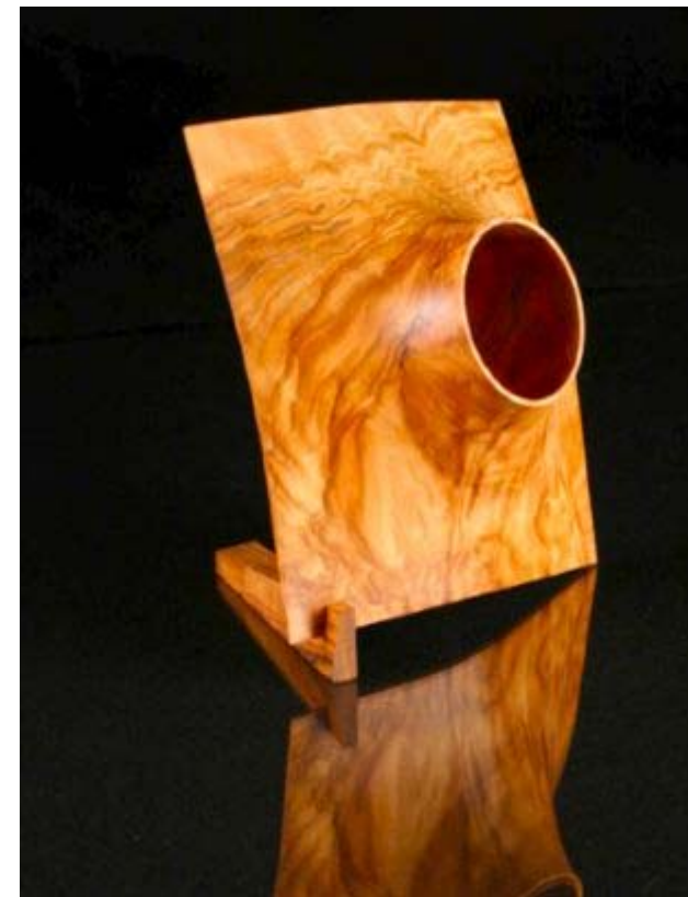
By: Stuart Batty